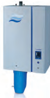
Condair RS Resistive humidifier Innovative scale management and no disposable boiling cylinders.