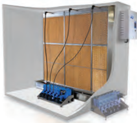
Condair ME Evaporative in-duct humidifier Provides low energy humidification and evaporative cooling.