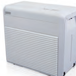
Defensor PH Mobile evaporative humidifier Suitable for areas up to 900m 3 and can be plumbed-in or fed via a water tank.