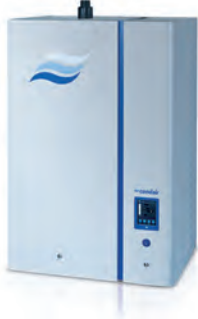
Condair EL Electrode boiler humidifier Reliable steam humidification that is easy to install, use and service.