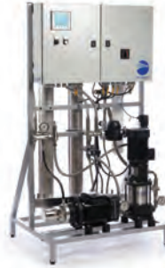
Condair HP High pressure in-duct humidifier Spray humidifier delivering humidification and evaporative cooling to multiple AHUs.