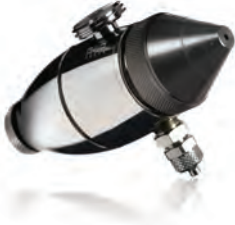
Condair JetSpray Compressed air and water spray humidifier Direct room spray humidifier with rapid evaporation and highly directional aerosols.