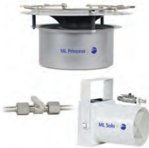
ML System High pressure in-room humidifier Water treatment and pressurisation plant with a selection of direct air nozzle systems.