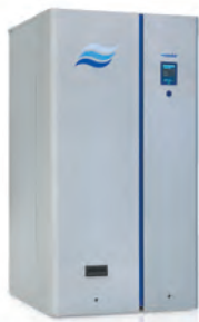
Condair GS Gas-fired humidifier Steam humidification with the operating economy of gas.