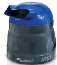
Condair ABS3 Rotary Disk Atomizer Economic cool mist system ideal for production and agricultural areas.