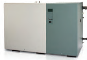
Condair SE Steam-to-steam humidifier Uses a building's impure steam supply to create pure humidifying steam.