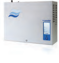
Condair RM Low capacity resistive humidifier Offers 2-8kg/h of steam for in-duct humidification.