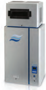
Condair US Ultrasonic in-room humidifier Very low energy cool mist humidifier with fan unit.