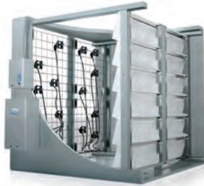
Condair DL Hybrid in-duct humidifier Close control, spray and evaporative humidifier.