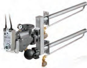
Condair ESCO Live steam humidifier Uses a building's existing hygienic steam supply.