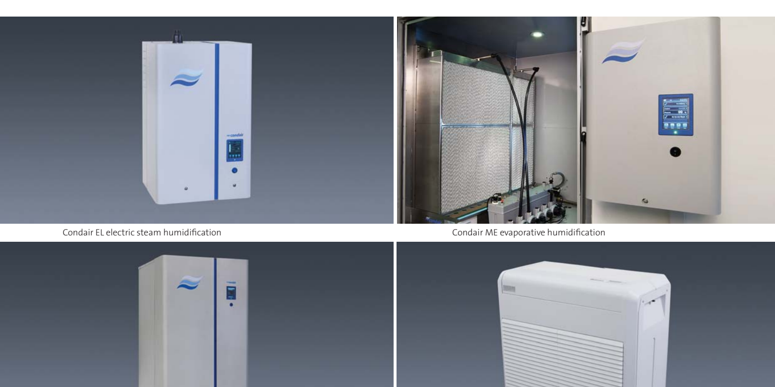
Condair GS gas-fired steam humidification

Alongside this comprehensive range of humidifiers, Condair has the experience to deliver the right solution for any heritage application and support customers in the field with specialist engineering services.