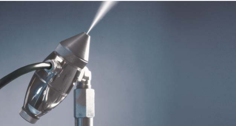
Direct room spray humidifier