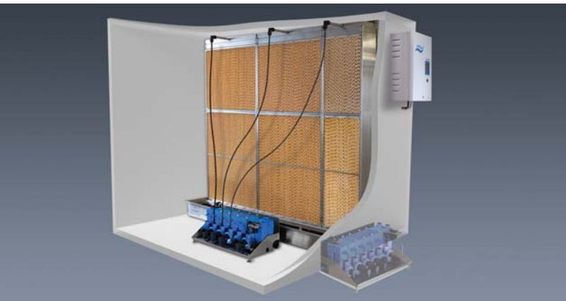
Induct adiabatic humidifier